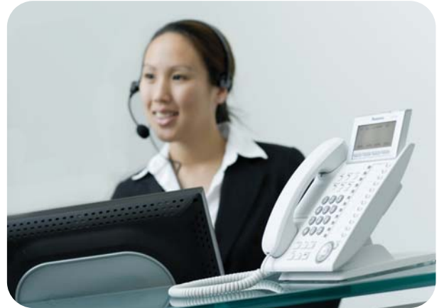
RECEPTIONIST USING COMMUNICATION ASSISTANT

Operator Console also supports the following additional options: