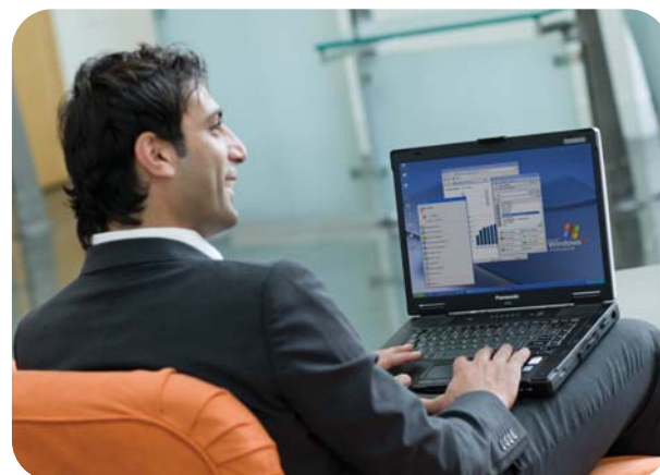
A TEAM MANAGER USING CA SUPERVISOR

Communication Assistant Supervisor application is an indispensable productivity tool for team managers and supervisors. The software allows team leaders an easy way to keep an eye on all their team members' telephony communication activities. Group leaders can easily monitor team member's phone status, call details, presence and availability - perfect for managing an informal call centre or a small team receiving customer calls. In addition to the features supported by CA Pro, the following key features are additionally supported: