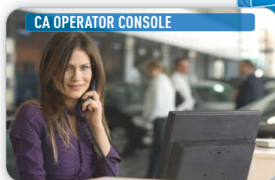
CA OPERATOR CONSOLE