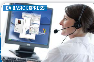
CA BASIC EXPRESS