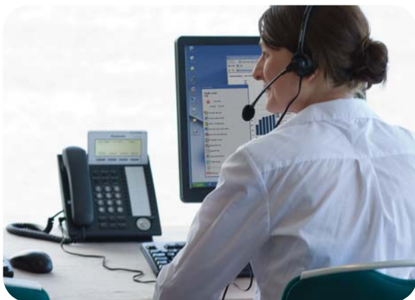
CA - PROVIDING UNIFIED COMMUNICATIONS