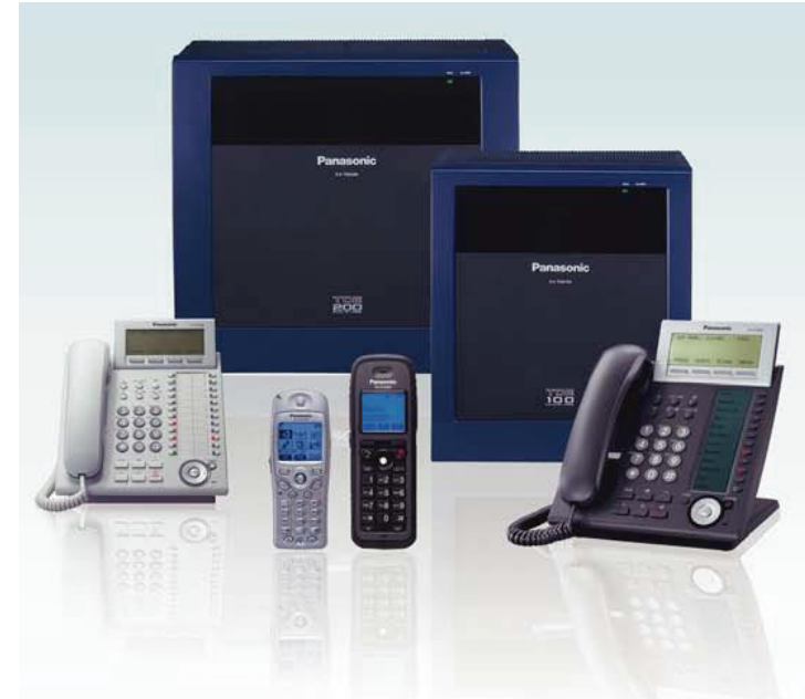
The TDE Systems - Designed for Today and for the Future

Investment in a telecommunication system requires business communication foresight. Businesses need to be able to effectively communicate today - yet want to make sure that they are properly equipped to handle the growing demands of their future communication needs. Highly modular and empowered with the latest SIP technology; the new KX-TDE IP PBXs are an ideal communication platform for customers to solve all their business telephony needs today as well as in the future as they embrace full IP telephony.