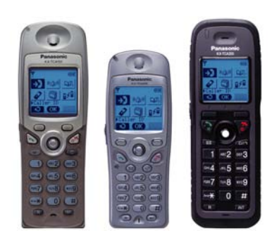
KX-TCA series DECT wireless handsets