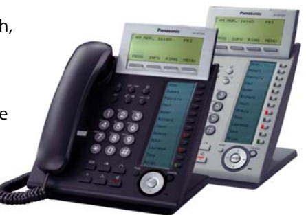
KX-NT300 series IP Proprietary Telephones

The KX-NT300 series IP telephones take you to a new dimension in audio experience, communications productivity, broadband network connectivity and customer care. These IP telephones bring you the power of the advanced KX-TDE IP PBX systems - allowing quick access to the entire spectrum of KX-TDE advanced features and applications.