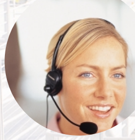
Travel Agency Record important conversation

When customers call to make reservation or ask questions, travel agents take notes, but if they misunderstand what the customer says, it can lead to complaints or cancellations. In this case, Panasonic's VPS can record important calls by 2-way recording/2-way transfer. Calls can be played back over and over to make sure of the customer's demands and preserve their trust.