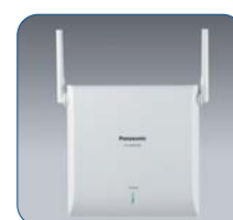
KX-NCP0158 8ch IP Cell Station