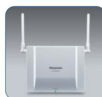
KX-TDA0158 8ch Cell Station