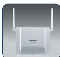
KX-TDA0156 4ch Cell Station