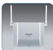
KX-TDA0155 2ch Cell Station